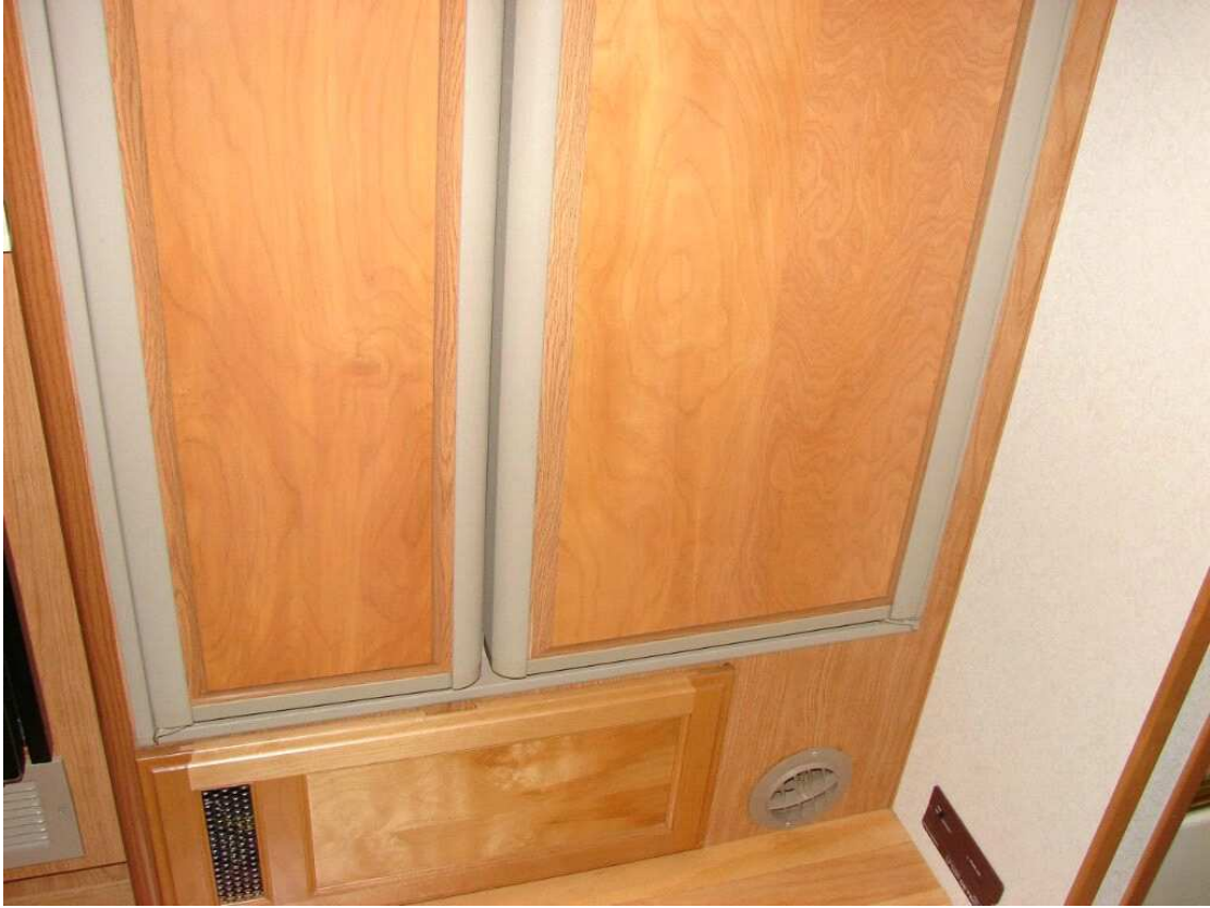
Disconnecting the propane and electrical connections -